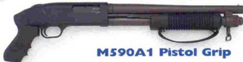
M590A1 Pistol Grip