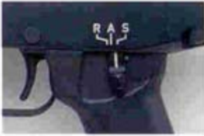
Ambidextrous selector on all models

A more streamlined Galil in two barrel lengths and two calibers.