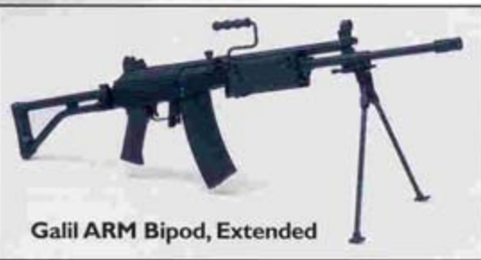
Galil ARM Bipod, Extended

W hen assault gun firepower is needed in close quarters situations, the Micro Galil is the answer. It carries a full 35 round magazine of .223 ammunition, yet is no larger than the standard UZI. In either semi-auto or selective fire versions, this ultra-compact Galil has all the quality and reliability that made the full-sized Galil famous.