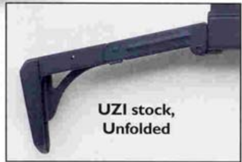
UZI stock, Unfolded