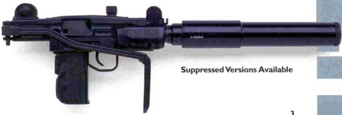
Suppressed Versions Available