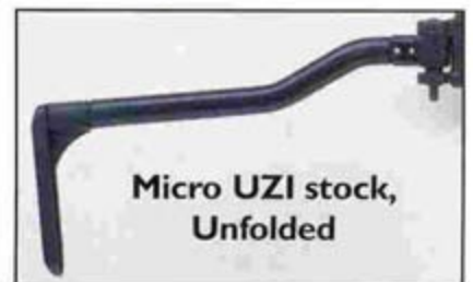
Micro UZI stock, Unfolded