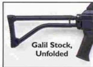
Galil Stock, Unfolded