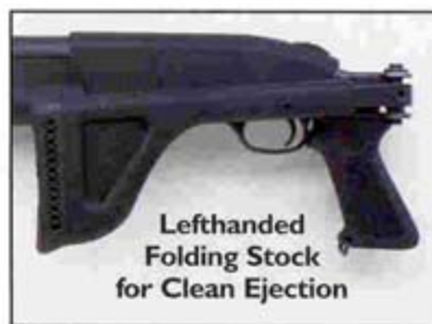
Left-handed Folding Stock for Clean Ejection

Only Mossberg's mil-spec experience and advanced shotgun design abilities could create an autoloader capable of winning military contract DAAE20-96-P-0363.